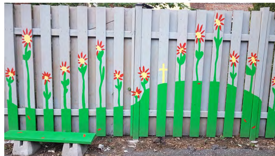
flowers & Cross NDG graffiti

And this is Paul's focus: God is alive, active, good - and experienced through Jesus the Christ. This is all seen, ironically, through Jesus dying on the cross. God will suffer for us, and is not defeated by anything. God's love even reaches out to a sinner like Paul was, turning him into a voice of hope.