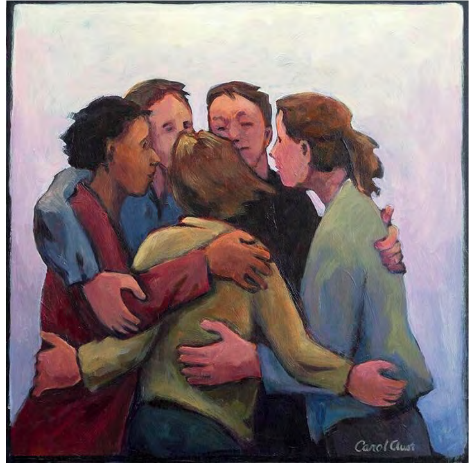
Embrace 23 - C Aust