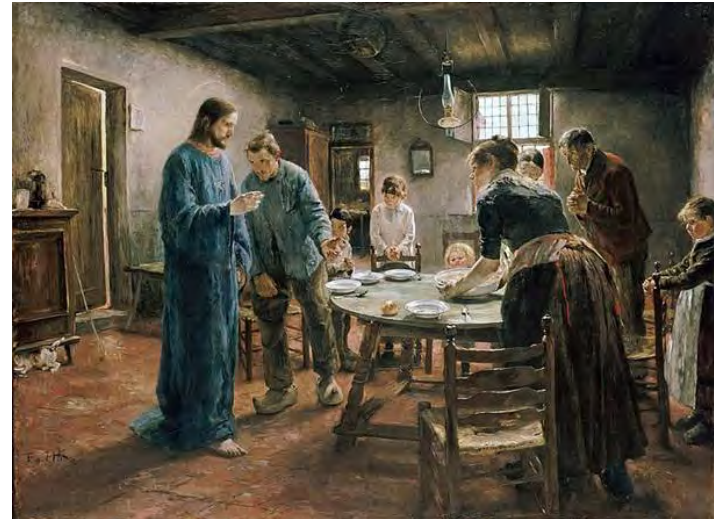
mealttime prayer - von Uhde