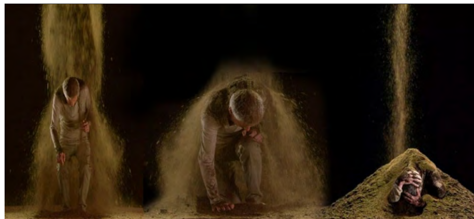
Martyrs - Earth - Bill Viola