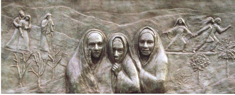
women at the tomb - Bryans