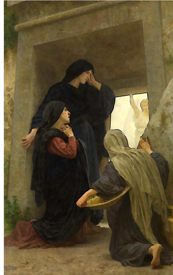
the holy women at the tomb - William Bouguereau

Drop Box: Food donations are welcome for the local Food Pantry, diapers for young mothers through Head & Hands, and cloths & accessories for the New Hope Boutique.