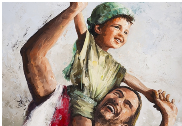
Become like little children Bota