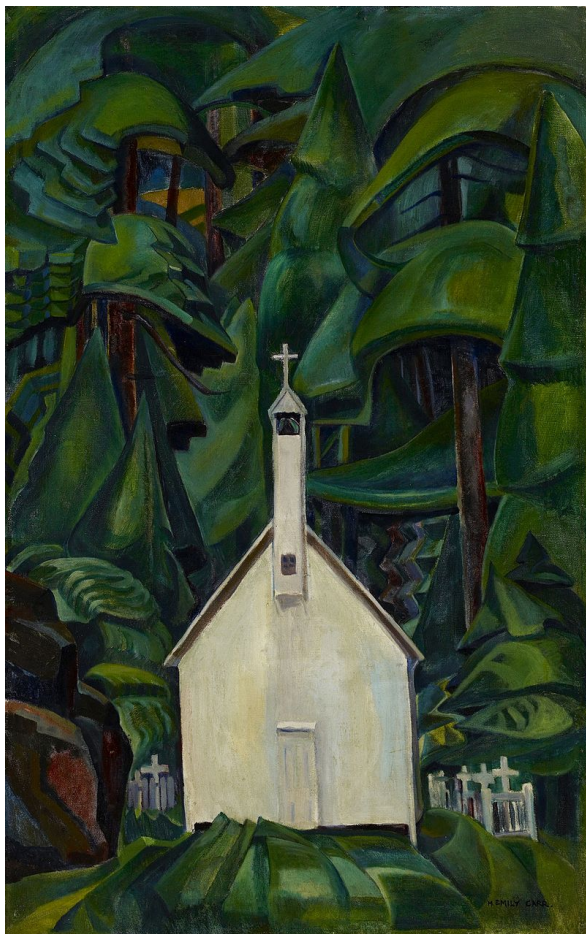
Church in Yuquot - Emily Carr

You've probably gathered by now that I like art; all kinds of art: visual, musical, word, movement, .... Art is powerful and complex. It can teach us, comfort us, challenge us - all parts of us: minds, bodies and (especially) emotions.