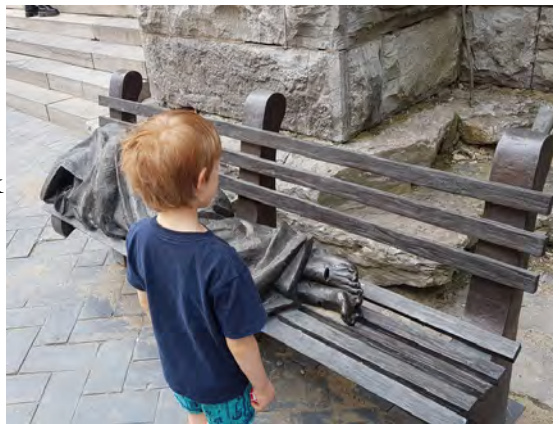
Homeless Jesus - T Schmalz

Where do you think following Jesus will lead? What are our dreams? When we think of how we want the church to be, do we picture greatness? What sort of greatness?