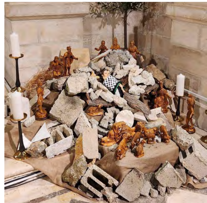
Nativity in Bethlehem 2023

The minister didn’t bring up Hamas, which is different than the Christmas story. He does point out how different God is in the way Jesus brings peace - in his birth, life, and in his death Jesus does not raise armies or use force. His point is that God goes into tragic situations and lives with people.