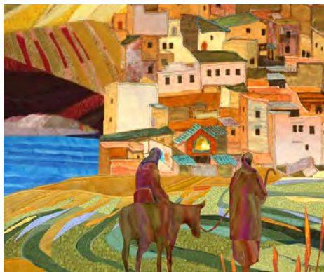
Road to Bethlehem M Torevell