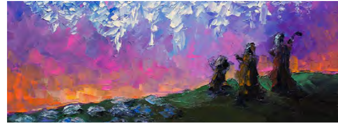
Heavenly Host - M Moyers