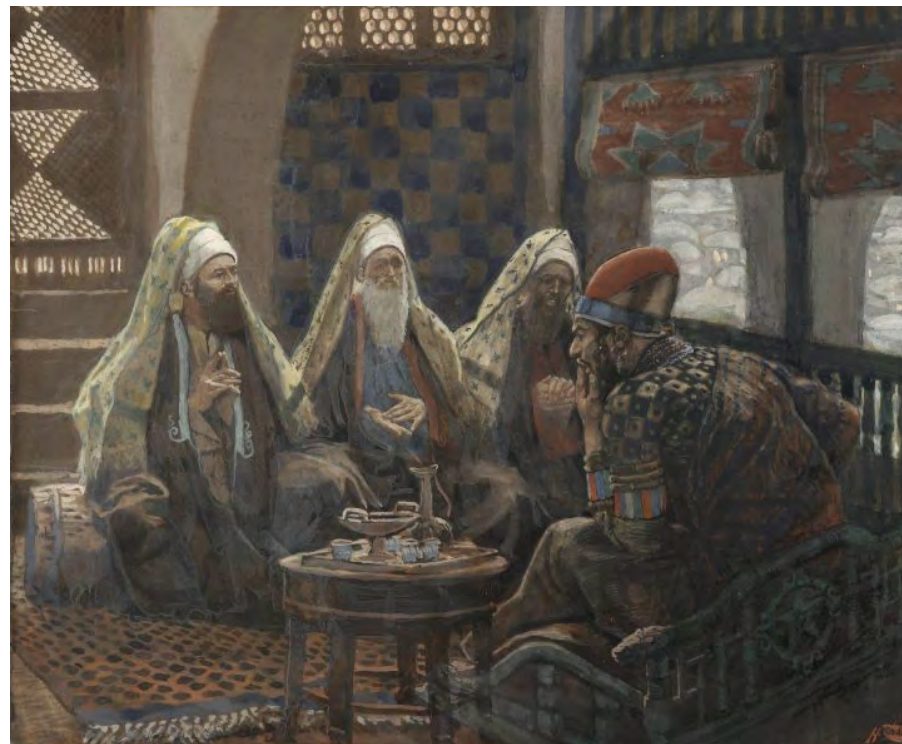
Les rois mages chez Hérode - James Tissot

Hear the good news spoken by the angel to Joseph She will give birth to a son, and you are to give him the name Jesus, because he will save his people from their sins. Thanks be to God.