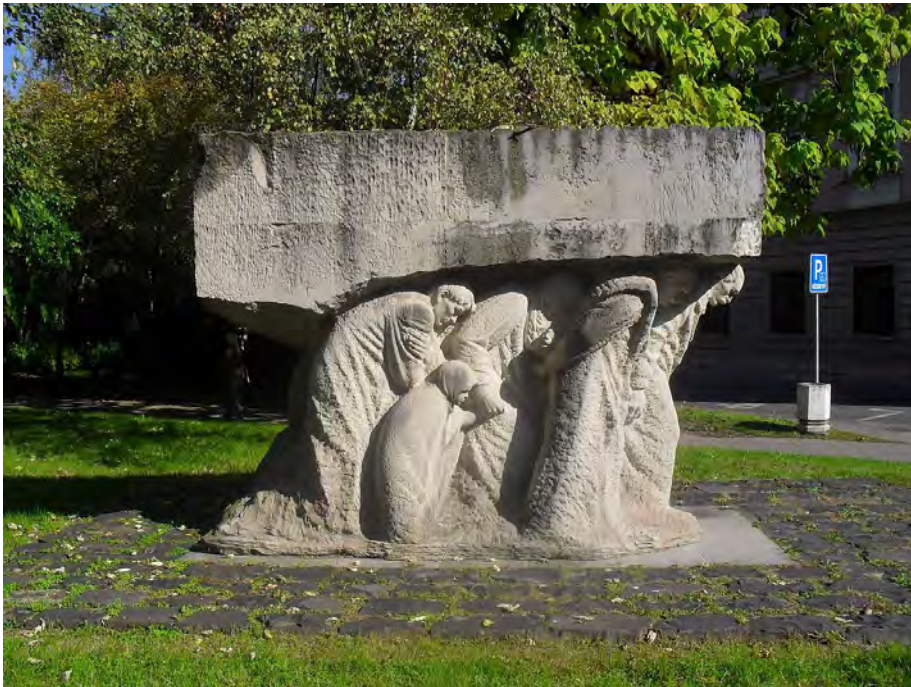
Memorial to the Persecuted - Bearing a Heavy Weight Together - Péter Gáspár

The psalm you've already been introduced to, but we're going to say it again in a slightly different translation. It's worth repeating.