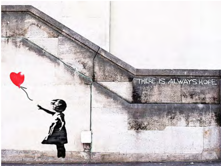
There is always hope - Banksy