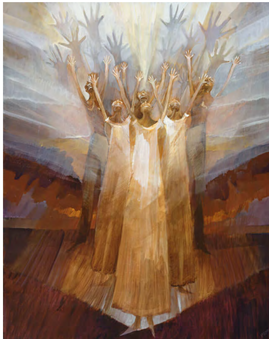
Hear My Praise - R Blumenfeld