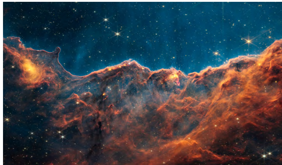
James Webb Space Telescope - New stars