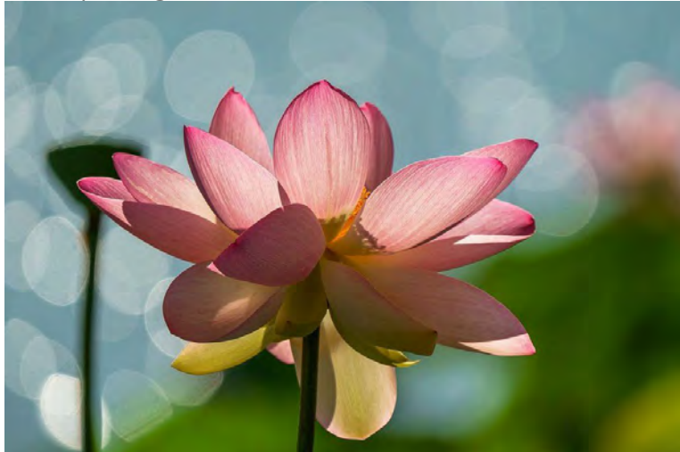
Controluce - Gianluca Benini

for thy Kingdom come on earth as it is in Heaven. 2