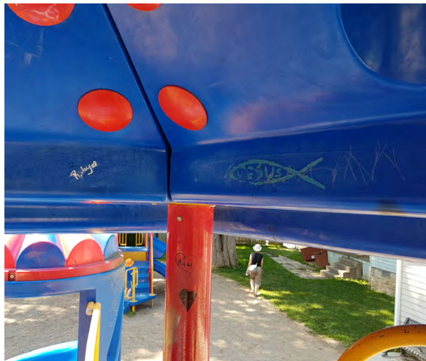
an unexpected fish

I’m not saying my sister didn’t pray, and I wasn’t a part of her prayers, but we need to remember that it starts with prayer based on the foundations of God. It doesn’t start with the house we want to build - the vision we think would be best. It doesn’t start with thinking we should go help in Africa. We start with asking ‘Thy Kingdom come. Your will be done on earth as it is in Heaven.’