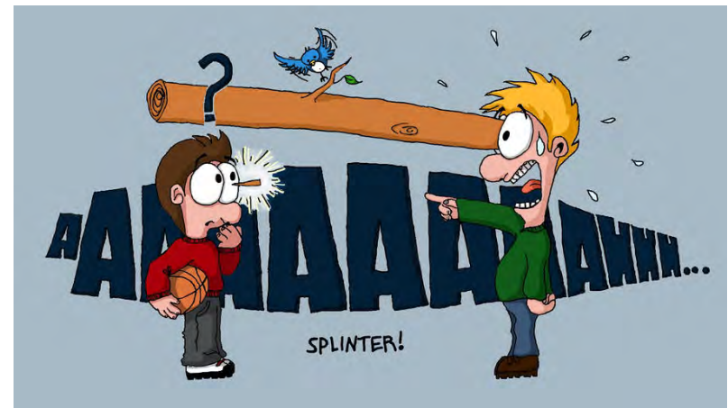
matthew 7:1-5 - ladymuffinart

Jesus gives a warning about judging - that in judging others you'll also be judged. That's serious, but could you picture the example Jesus gives? Trying to get a speck of dust out of your neighbour's eye with a 2x4 in your own? Imagine that happening; that's funny. Jesus does talk about serious things in the Bible, but there are these silly examples as well.